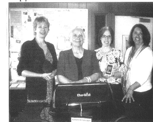
Simply Home raffle winners